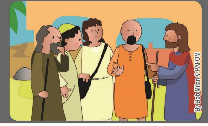
When they got there, Jesus asked them: "What were you talking about?" They were ashamed and didn't answer. In fact, they had been discussing which of them was the greatest and the best.