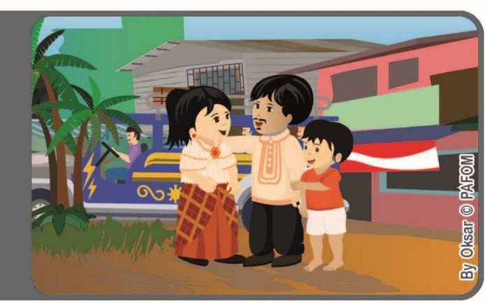
A few days later, my dad found a new job and we were all very happy. I thanked our Father in heaven!