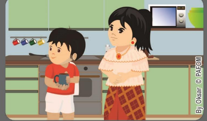
So I started to help around the house. One night my dad wanted a cup of coffee. I asked my mom to teach me how to make it and I prepared a really good cup of coffee for him.