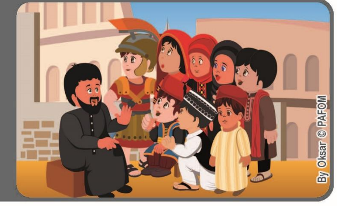
But just the same he was able to preach the Gospel to many people. God has a beautiful plan for everyone and if we trust him, he will fulfill it.