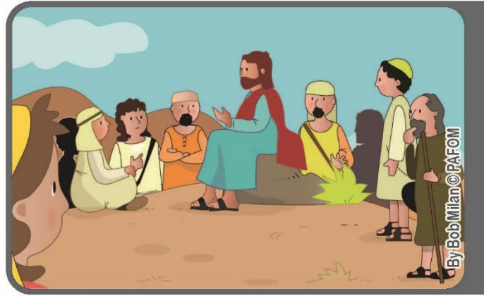
Jesus went up on a mountain and sat down. He told the people about the "beatitudes," listing all those who are truly "blessed" and full of joy.

"Blessed are the peacemakers, for they will be called children of God." (Mt 5:9)