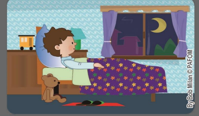
That night in bed I thought about our fight and I couldn't fall asleep. I wanted to tell her I was sorry, but I don't know how to write yet. So I got an idea.