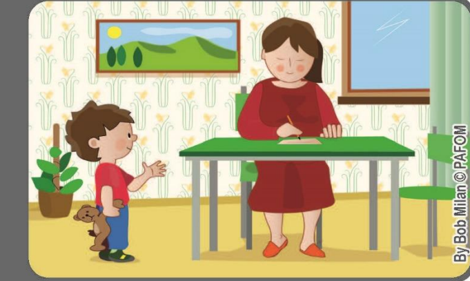
The next morning I asked my mom to write it for me. I told her to write: "Please forgive me and I forgive you too. I love you!"