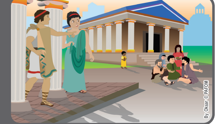
Many people were amazed to see how happy they were to be together. They were struck by the way they encouraged each other and helped one another to understand how to live in unity and peace.